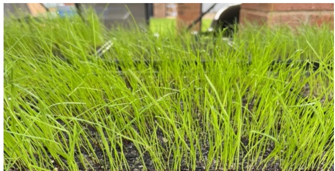
Treated - MP ROOTS + MP REINFORCE